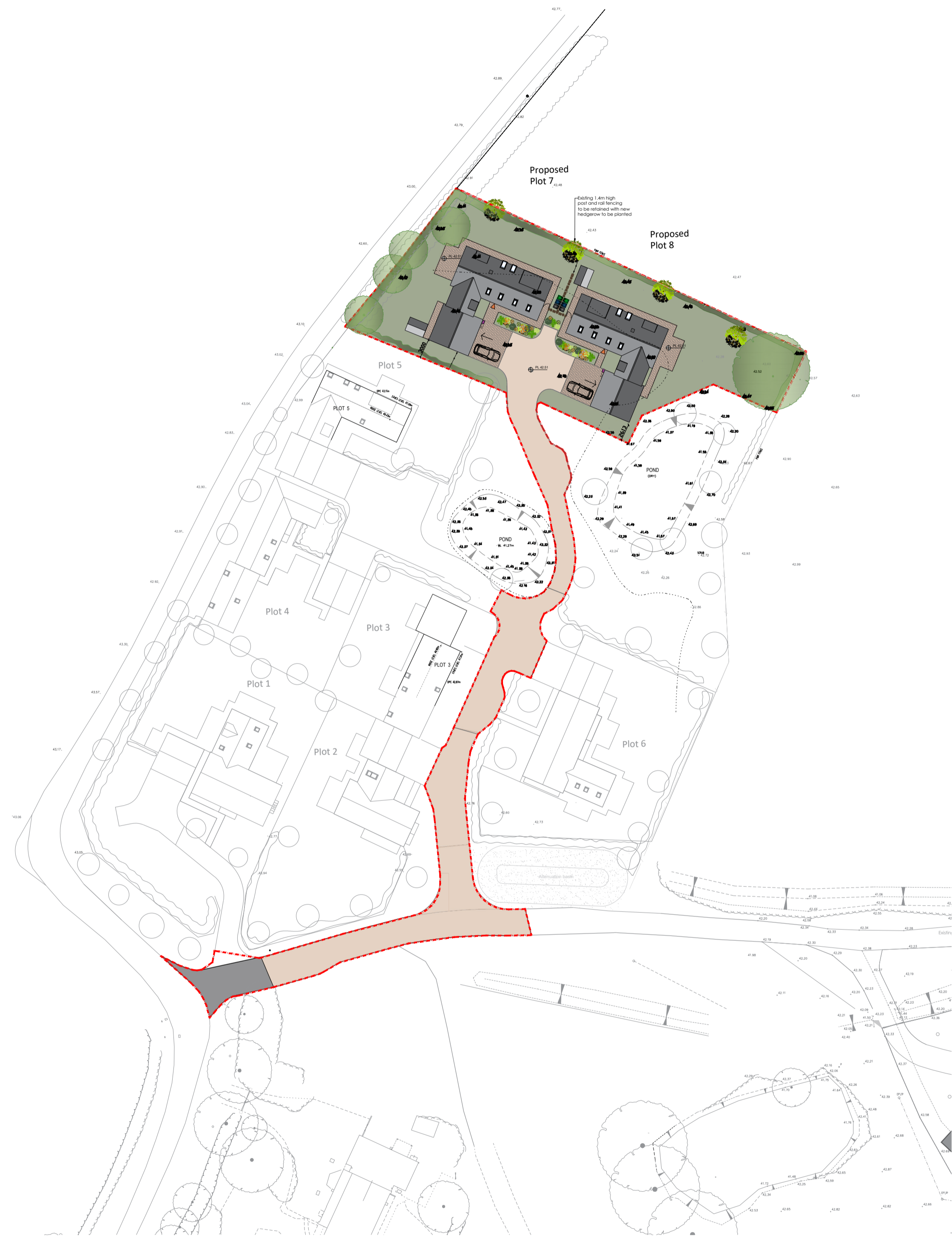
1:500 Proposed Site Plan