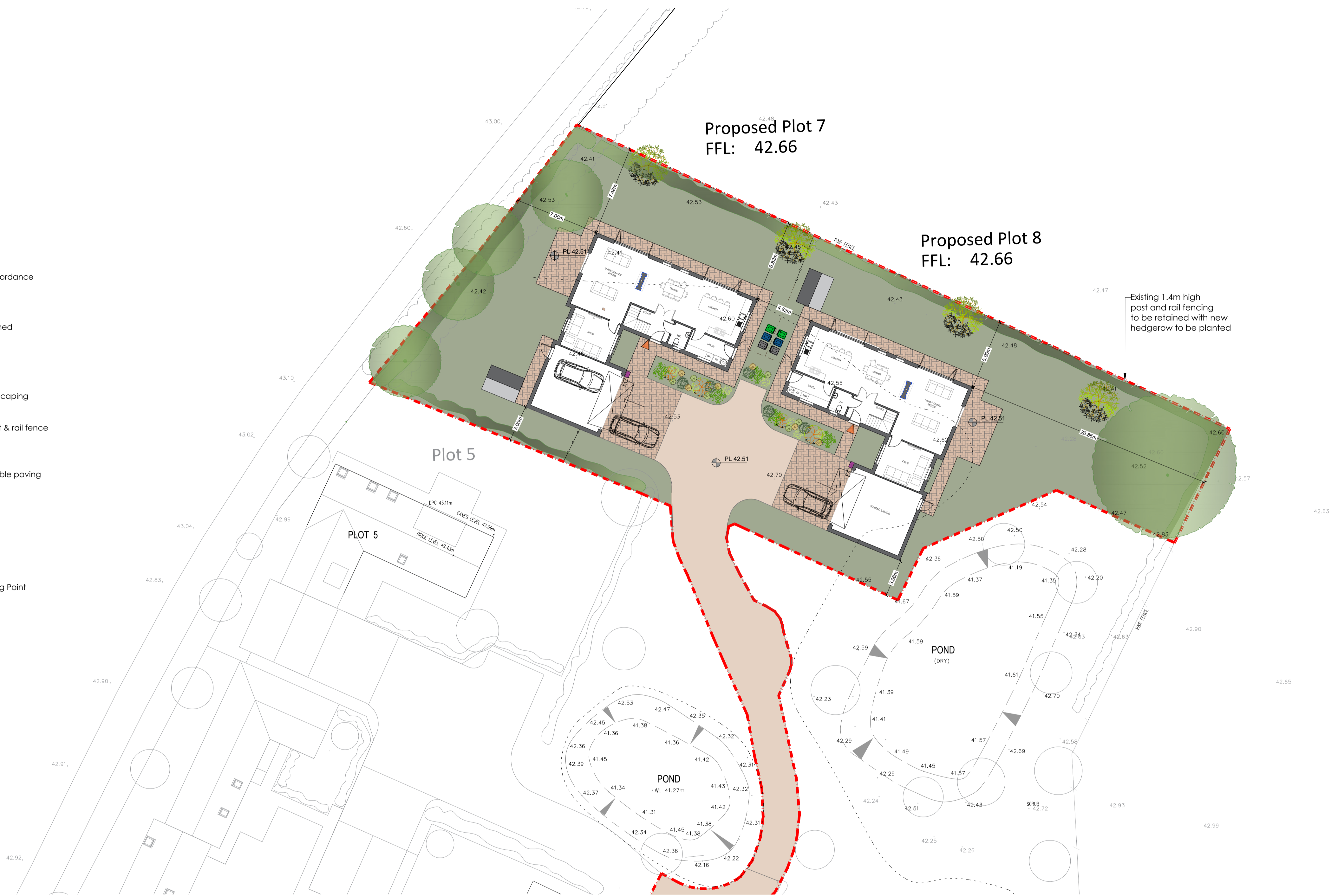
1:200 Proposed Block Plan